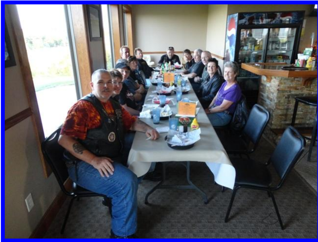
July Birthday Ride