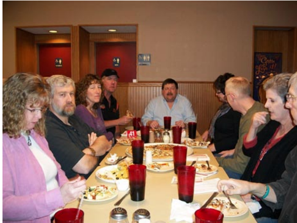
Dinner Ride to Godfathers