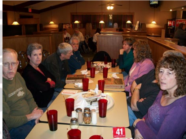
Dinner Ride to Old Time Café